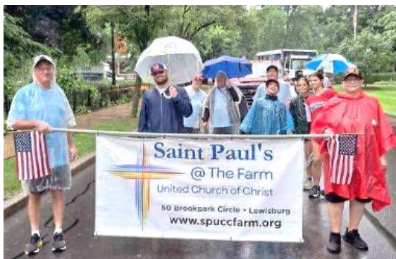
A little (or a lot) of rain never dampens the spirit of Saint Paul's! Thank you to all who helped with this year's Union County 4 th of July Veteran's Parade. Memories made. Fun had!

Serving @ The Farm. Mission and Outreach is an integral part of us "being the church" at Saint Paul's. On the 2 nd & 4 th Thursdays of each month, we offer a Fresh Express Food Distribution in partnership with the Central PA Food Bank. Volunteers join us from 1 to 5 p.m. at Grace Place @ The Farm as we receive, sort, and distribute fresh food and groceries to our neighbors. All are welcome as we have a wonderful time serving together. Next distributions are July 9 & 23. We also participate in Community Harvest , a monthly meal program in conjunction with Bucknell's Center for Community Engaged Leadership, Learning & Research. We cook on the 4 th Monday of each month from 1-4 p.m. at St. John's UCC ( next date is July 18 ) and assist on select months with monthly distribution there on the 3 rd Saturday from 9 a.m. to noon.