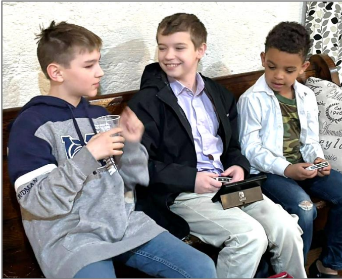
Making friends at Easter Breakfast!

Sundays @ The Farm. At 9 a.m. our coffee is brewing, and the nursery and sensory rooms are staffed and open. Our Faith Connections classes run from 9 to 10 a.m. and include Pre-K to 3 rd Grade Explorers ; 4 th to 8 th Grade Pathfinders ; and 9 th Grade to Age 99 Travelers . From 10 a.m. to 10:20, please enjoy breakfast, coffee, and fellowship then worship begins at 10:30. Following the “Time with Our Children,” during worship, kiddos aged 3 to 2 nd grade head back to the classroom for “ Children’s Church ” and return to worship following Pastor Tim’s sermon. On the first Sunday of each month, we celebrate Holy Communion together. And, monthly on the 2 nd Sunday, we enjoy Family Night from 5 to 6:45. On the 3 rd Sunday of each month , we gather around the tables in fellowship hall for a meal together.