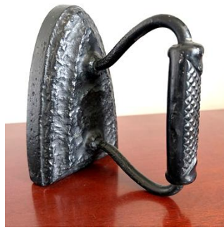
An early 1900's cast iron iron (aka doorstop).

"This gift is about propping the door open to radical Hospitality, defending the Vulnerable and offering/providing comfort for the Broken, which We All Are . Thank you for ALL of you! With great admiration."